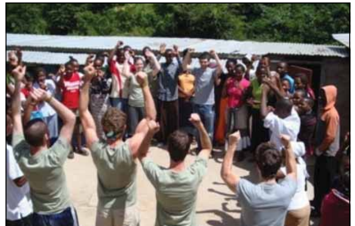
Participating in a workshop.