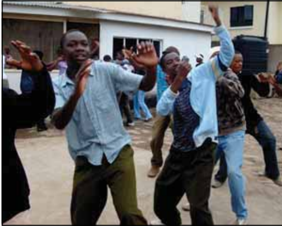
Students practicing their dance routine.