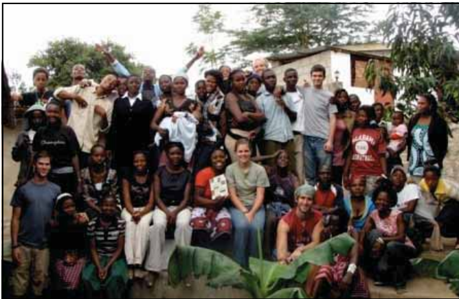
The students & our visitors.

During the second week, the students prepared different pieces to be performed at a fundraising event held at a venue in central Arusha. Our students presented a number of compositions in small groups, many of which were created from their own poetry and song writing. The performance ended with all the students doing a remarkably choreographed dance routine which was full of attitude and style! Over 200 people came to the event and theumojacentre was able to raise over £400/AUS$817 from ticket sales and a raffle sponsored by businesses in Arusha. Our students were amazed by the skills and enthusiasm of the Juilliard visitors and this has inspired them to be more creative and reach for their goals. Never having experienced any kind of creative arts before, they were captivated every day. New friendships have been made and we hope that this connection with The Juilliard School will continue for many years to come. Visit our homepage on Facebook to see videos of their performance. http://tinyurl.com/umoja_centre