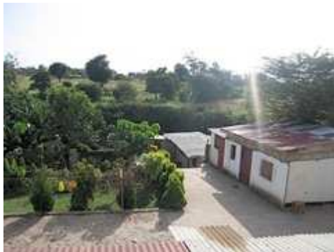
A view of the garden from the kitchen window

If you are interested in birds bring a guide book as there are many colourful visitors to the garden. Monkeys are occasionally seen in the trees in the adjacent property.